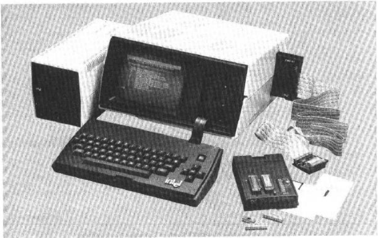
Figure 2. IPDS™ System With Optional Modules Installed